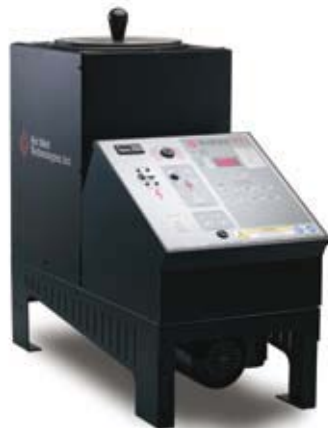
G5-50 AutoPack with a 50-lb melt tank