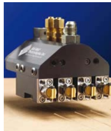
Aimable, Low Profile