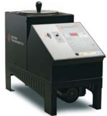
HP-535 AutoPack with a 35-lb. tank