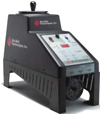
HP-20 AutoPack with a 15-lb. tank