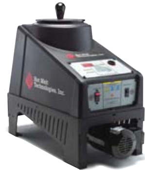
215 AutoPack with a 15-lb. tank