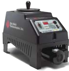
205 AutoPack with a 8-lb. tank