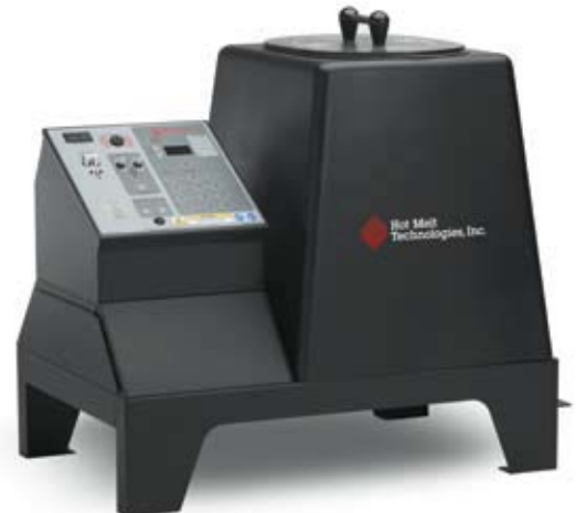
G5-135 Autopack with a 135-lb melt tank