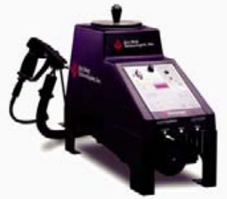
Benchmark 300 Series (Benchmark 315 shown) For low-volume applications.