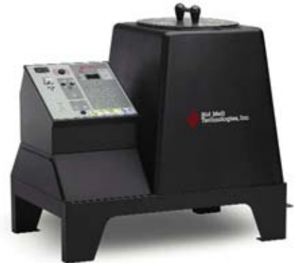
ProFlex Series (Proflex G-950 shown) For high-volume applications.