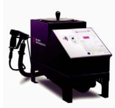
Benchmark 500 Series (Benchmark 515 shown) For medium-volume applications.

HMT offers a full-range of hot melt systems to handle your foam-encased, pillow-top, pocket coil and foam layer lamination mattress applications.