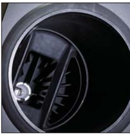
Melt tank with dual pre-melt grids.