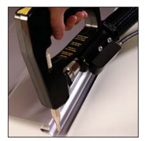
For metal roof seam sealing with handguns or automatic