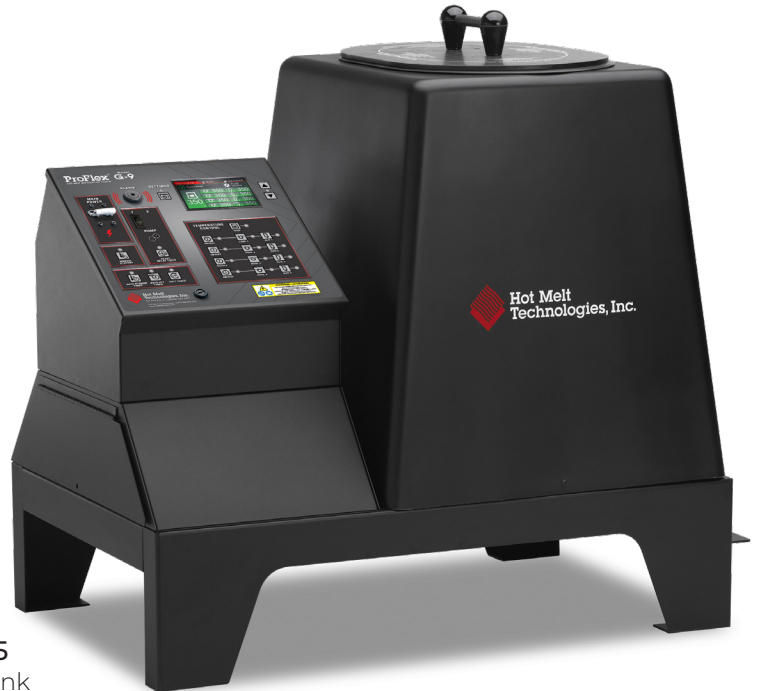
ProFlex® G9135 w/ 135 lb Melt Tank