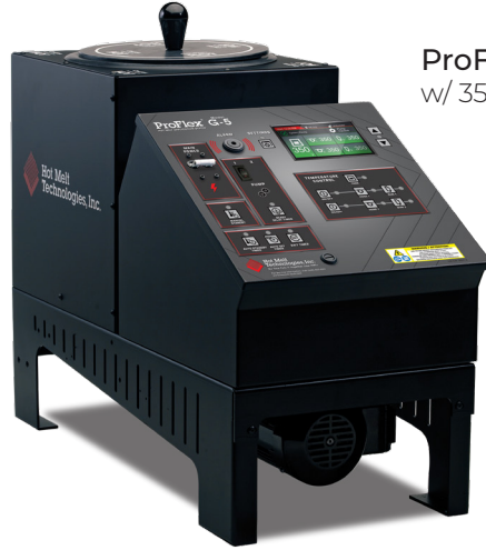
ProFlex® G535 w/ 35 lb Melt Tank

Hot Melt Technologies, Inc. No One Puts It Together Like HMT®