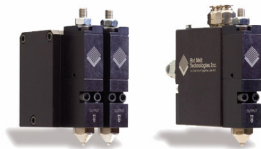
900 Series Automatic Guns