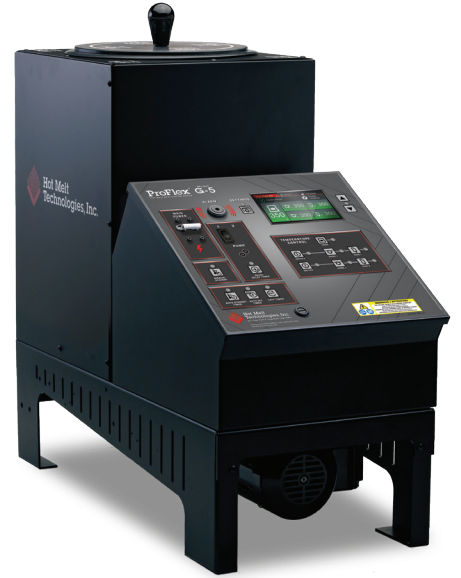
ProFlex® G550 w/ 50 lb Melt Tank