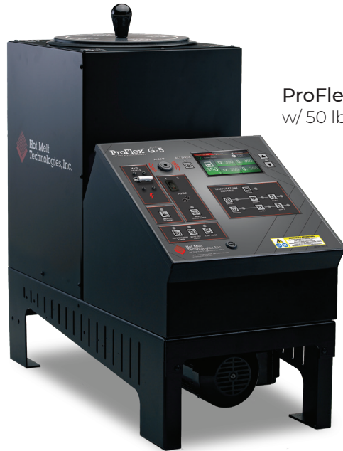
ProFlex® G550 w/ 50 lb Melt Tank