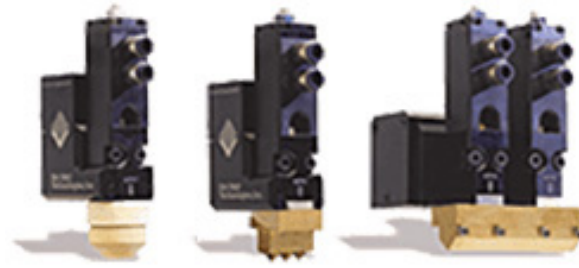
600 Series Automatic Guns

HMT 800 and 900 Series Automatic Guns are designed for packaging and converting applications: