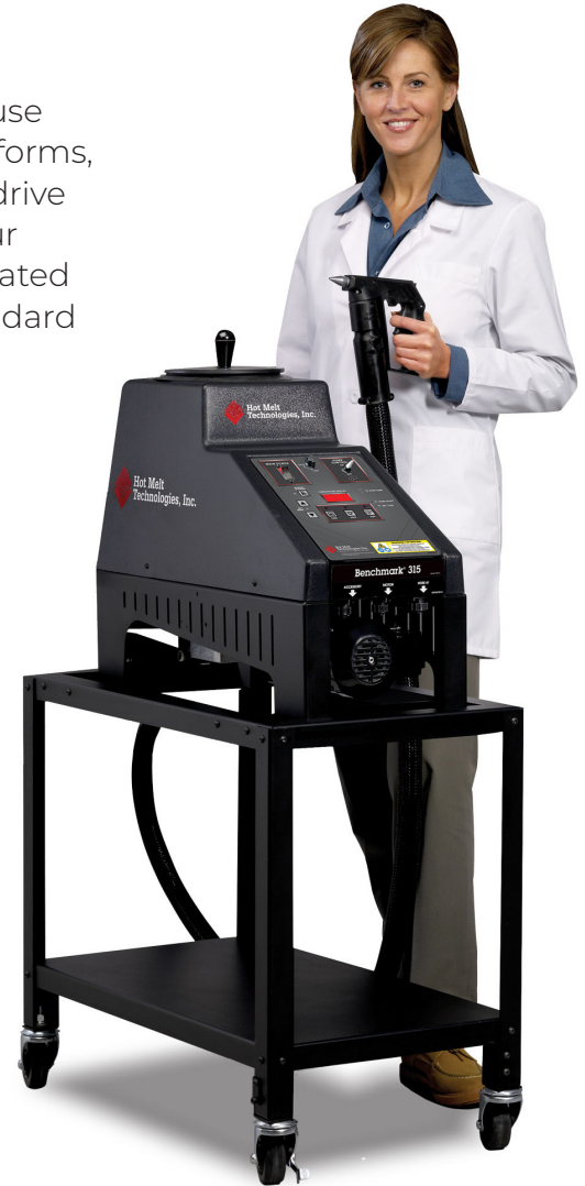
Benchmark 315 and 715

Pre-assembled and ready-to-run right out of the crate, these Benchmark systems have a modular 15-lb. capacity melt tank and full featured microprocessor temperature and process control. They can be equipped with 8, 12, 16 or 20 ft. hoses and any of HMT's handguns and nozzles. Easy to operate and maintain. 120vac or 220vac operation.