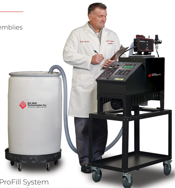
HMT's ProFill System automatically fills your tank

1723 W. Hamlin Road Rochester Hills, MI 48309